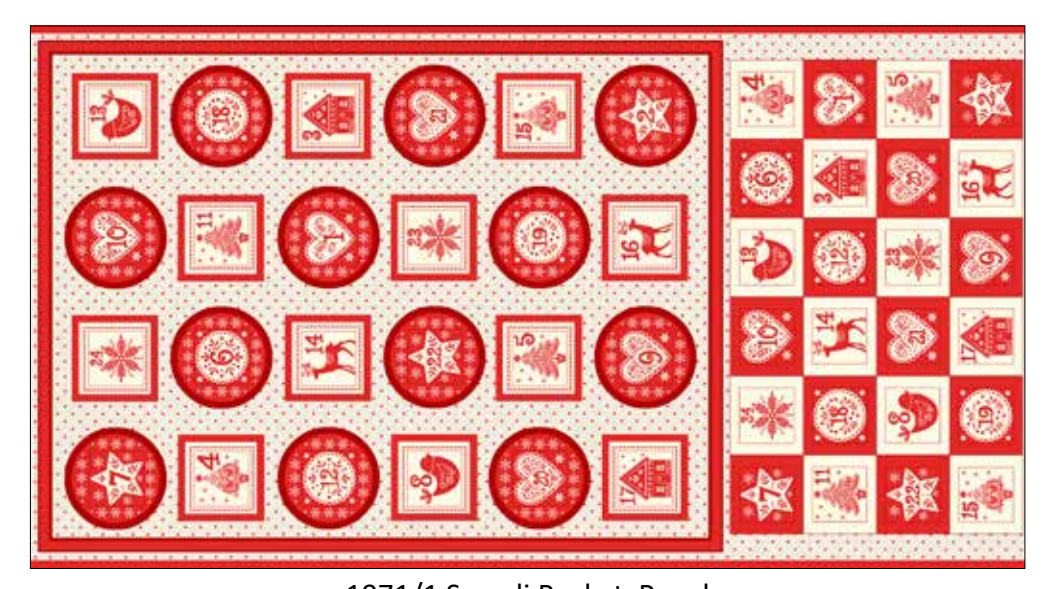
1971/1 Scandi Pocket Panel