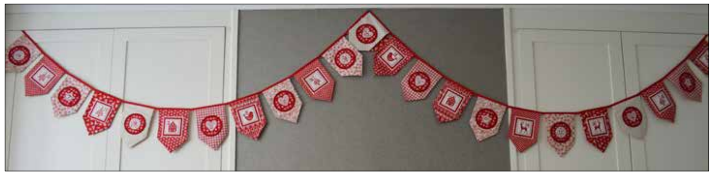
Scandi Advent Bunting