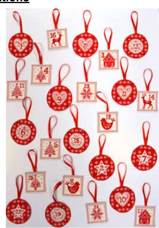
Scandi Advent Tree Decorations